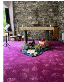
The chapel at Noddfa